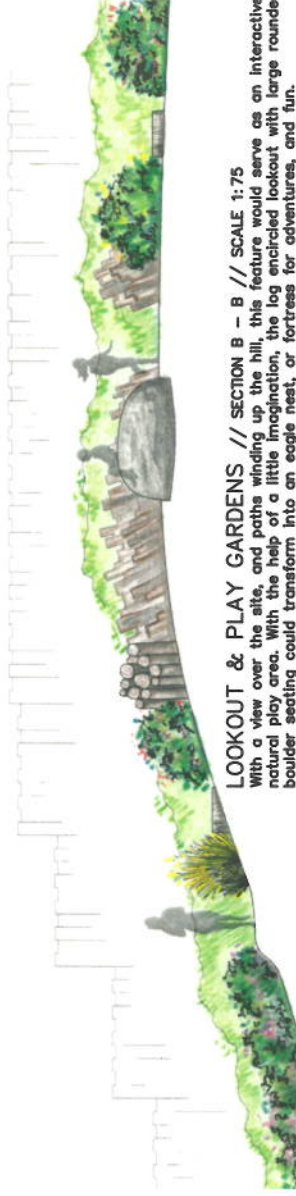
LOOKOUT & PLAY GARDENS // SECTION B - B // SCALE 1:75

The garden beds, broad lush canopy, and logs for seating help to create a forest-like setting and make this a great spot to swap stories, share a picnic or simply relax. The large deciduous tree would be symbolic of the sycamore trees which were once iconic of the neighbourhood.