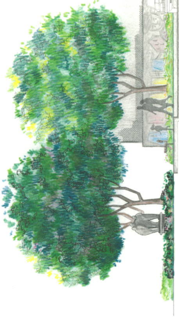
PARK ENTRANCE // SECTION A - A // SCALE 1:75

A strong sense of arrival is promoted through this extension of park space into the streetscape. Hardy garden beds with shrubs, and trees enhance the pedestrian experience, and add year-round interest, and aesthetic. This parkette also provides an opportunity for incorporating a focal sculpture feature, and murals along the court retaining wall.