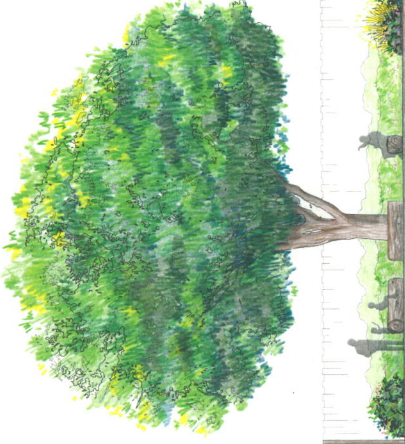
STORY NOOK // SECTION D - D // SCALE 1:75

This communal garden space provides an exciting opportunity for the community to get involved, volunteer and connect. This area could also showcase local sculpture, and could provide space for the future development of a year-round greenhouse, and public washrooms. Other features of this area include a secure shed, compost bins, rain barrels, secure potable water facet, drinking fountain and an asphalt games area.